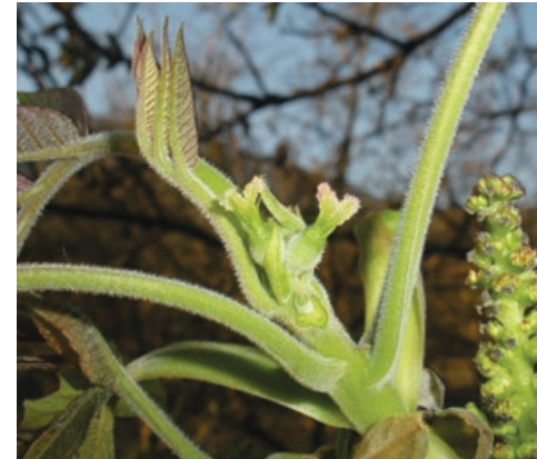
RECEPTIVE PISTILLATE STAGE